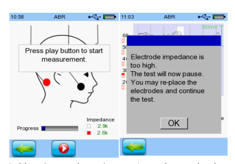
Calibration and continuous impedance checks help to increase quality of results and reduce time of measurement.

In contrast to competing manufacturers of ABR devices, Sentiero is the only device to do diagnostic ABR on a battery powered handheld device (power loss? No problem!) in a non-sedated setup in any room (no need for special shielding). External sources of electrical disturbances have less impact on the new weighted averaging algorithms with its powerful signal processor.