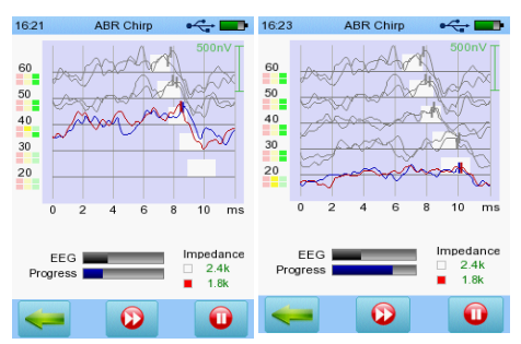
The evolution of an ABR measurement with automated peak marking and statistical evaluation of results (traffic lights).